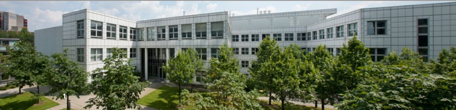
1 Fraunhofer EMFT building

FRAUNHOFER RESEARCH INSTITUTION FOR MICROSYSTEMS AND SOLID STATE TECHNOLOGIES EMFT